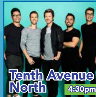
Tenth Avenue North